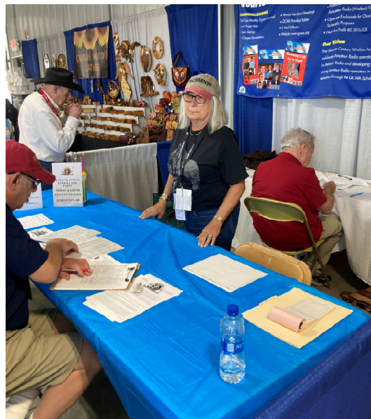
KC8MNW Signing up a new member with VE6AFO (left) and K8HLJ in the background.